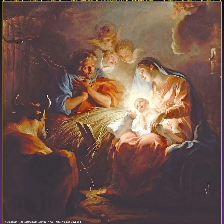
© Diocesan / The Athenaeum - Nativity (1730) - Noel-Nicolas Coypell III